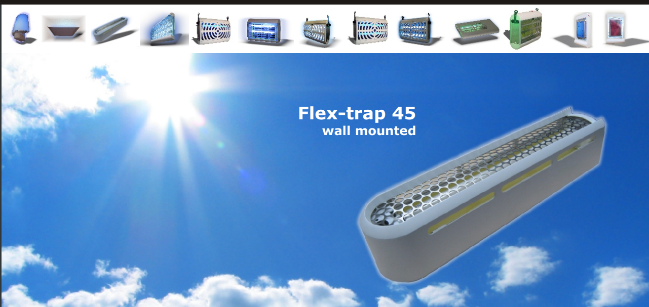
Flex-trap 45 wall mounted

Trappy i-trap 30/40 flex-trap 45 i-trap 50 i-trap 60 i-trap 80 i-trap 125HT i-trap 125E i-trap 125E WP i-trap 150EX i-trap 250E WP MicroTrap 100 MicroTrap 300